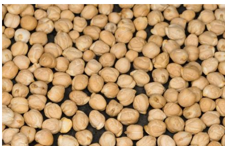
Figure 6. Chickpeas Postharvest

Also known as garbanzo beans, approximately 69 million cwt of chickpeas were produced in the U.S. on 6.2 million acres of land, with an average yield of 1,150 pounds per acre (Figure 6) (Agricultural Marketing Research Center, 2018). Montana, Washington, Idaho, and North Dakota produce the majority of the chickpeas grown in the U.S. India is the world's largest producer of chickpeas, followed by Australia and Pakistan (Agricultural Marketing Research Center, 2018). This legume has an indeterminate growth habit, which extends the production period of the plant significantly if late-summer conditions are cool or wet (Keene, 2020). Chickpea's deep roots make it more drought tolerant than other legumes (pea, lentil) when subsoil moisture is more available than moisture in the topsoil (Keene, 2020). Roots commonly grow between 1.5 to 2 meters (5–6 feet) deep. The most effective form of irrigation is buried drip line (Light et al., 2018).