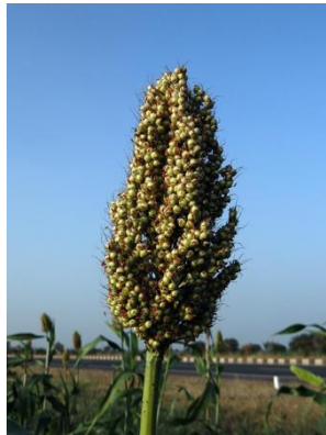
Figure 3a. Sorghum Plant

and helps minimize water loss, thus giving it better drought tolerance (Carter et al., 1989).