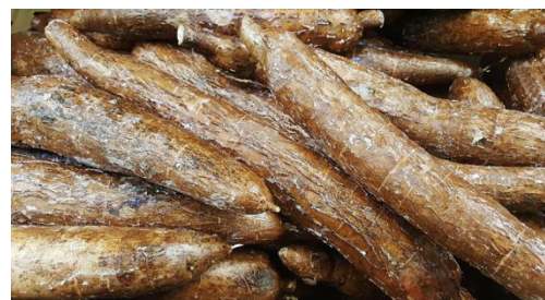
Figure 7. Cassava Root

Cassava grows well in many arid areas of the world, provided there is a long growing season. The crop easily adapts to periods of heat and drought (Long et al., 2017). Cassava yields 6–12 tons of root per acre with only potatoes and bananas producing more tonnage per acre (Ritchie & Roser, 2013). Cassava chips sell for around $250 per ton, but if modified starch is sold, it averages $540 per ton (Bangkok Post, 2018). Prices are farm-to-wholesaler from Thailand, which is the world's largest producer, and it exports most of what it grows to other countries.