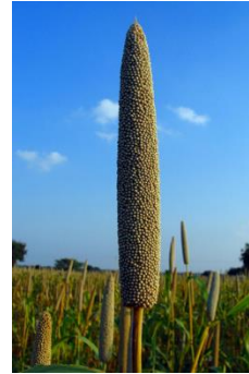
Figure 4a. Pearl Millet in the Field

cents per pound when the grain is sold to birdseed producers (Lee & Henning, 2014).