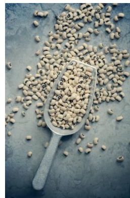
Figure 5. Scoop of Cowpeas

Cowpea is one of the oldest crops under cultivation (Figure 5). Cultivation began in Africa, alongside pearl millet and sorghum, and it is now grown all over the world (Quinn, 2012). The finished product in the United States is usually dried, canned, frozen, or used as livestock feed. More drought tolerant than soybeans, cowpeas can be used as a cover crop or a bush crop (Quinn, 2012). Like other legume crops, cowpeas fix their own nitrogen. The plant prefers a pH of 5.5–6.5 and grows best in well-drained soils to avoid root rots and other diseases (Wright & Knight, 2012).