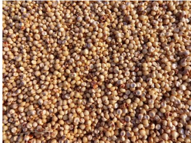
Figure 3b. Individual Sorghum Grains