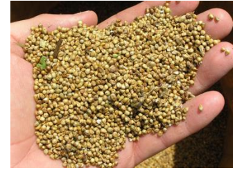
Figure 4b. Pearl Millet Postharvest