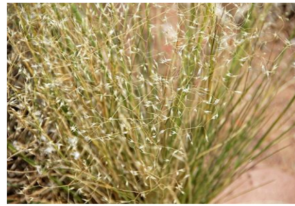
Figure 2. Indian Ricegrass, Top View

Indian ricegrass provides a forage food source for livestock and is particularly valuable in winter due to the plant’s ability to cure well (Range Plants of Utah, n.d.). Under dryland conditions, this crop will produce 100–200 pounds per acre (Wasowski, 2009). If irrigated, yields can double. The crop is also harvested dry and utilized like hay and is typically grown for personal use (Wasowski, 2009).