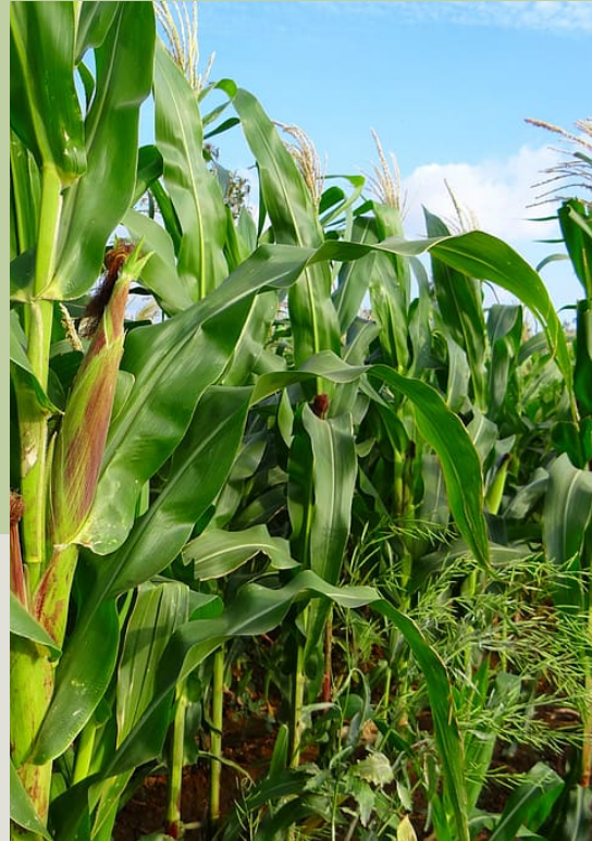
Figure 1: Maize is a staple crop grown in arid and semi-arid environments.

environments, yet scalable to more temperate climates. This paper will go over the rainwater harvesting equation to determine the volume of rainwater that can be collected, the area that can be cultivated solely using the harvested rainwater and the crop yield that can be harvested at the end of the growing season.