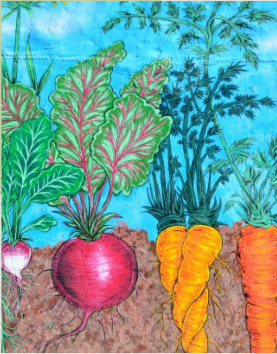
Figure 4: Illustration of various common garden vegetables

The AquaCrop Model also simulates the dry yield of various crops when simulating the net irrigation requirements. The model simulates the dry yield in tons over hectare which is dependent on the net irrigation requirements being met throughout the growing season. With some simple unit conversion, the total pounds of a specific crop, in this case Maize, can be calculated based on the area that can be cultivated. The example below demonstrates the total dry yield of Maize when the model simulates a total of 14.2 tons of Maize can be harvested if the net irrigation is met. Note that the dry yield was simulated with input parameters from northwestern Arizona. For more information on how to simulate the dry yield and calculate the total harvest in pounds, watch Part 3 and Part 4, respectively, of the 6 Part Series Video component to this paper.